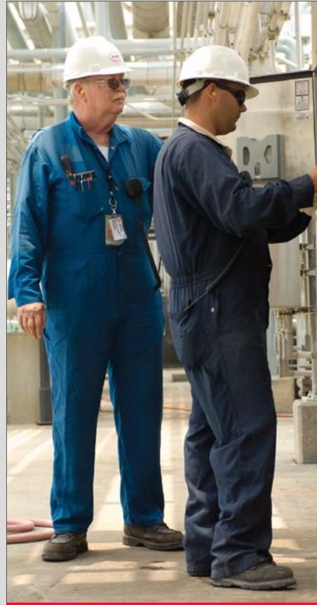
KBR ITI specialists monitor flow parameters to ensure quality control at refineries, facilities and chemical plants.

For over 25 years, ITI has experienced unrivaled success executing major projects, emergency re-builds, small capital projects and debottlenecking.