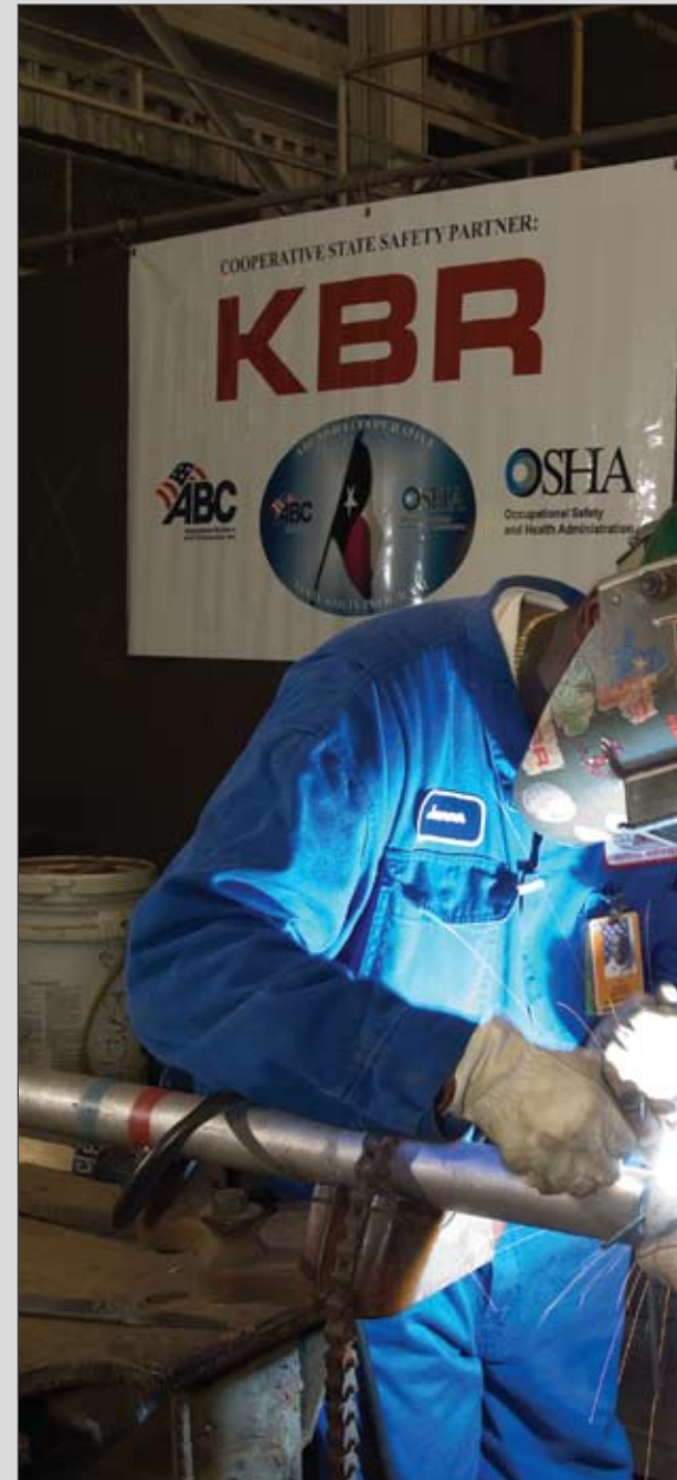
KBR's highly trained specialists adhere to HSE standards in all on-site maintenance, turnarounds and small capital construction projects.