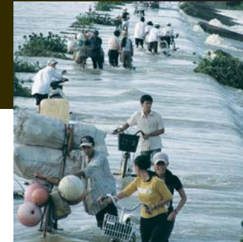
Quang Ngai Natural Disaster Mitigation Project, Vietnam

AGL's South Australian development will comprise up to five wind farms, capable of powering 240,000 average Australian homes. KBR has provided project management services for the first two stages of the development and is currently engaged on the third stage, consisting of 63 wind turbine generators and associated infrastructure. In addition to project controls and contract management, KBR helped AGL secure registration with the Australian Energy Market Regulator and the Office of the Renewable Energy Regulator.