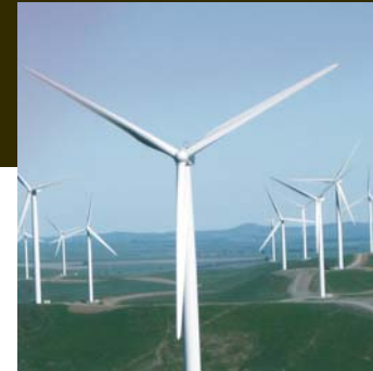
Hallett wind farm development, South Australia

KBR investigated the technical and economic feasibility of capturing all CO 2 separated at the Moomba gas plant, and then treating, compressing and transporting it via a pipeline for sequestration in nearby oil reservoirs. One of the few large-scale options to lower greenhouse gas emissions, this method of carbon capture and storage can also re-pressurise the depleted reservoirs and enable enhanced recovery of oil left behind by traditional extraction methods.